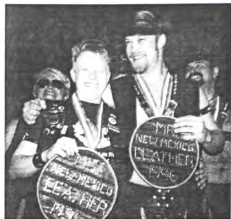
The 1996 New Mexico Titleholders

Don't miss it--it will be bigger and better than ever!