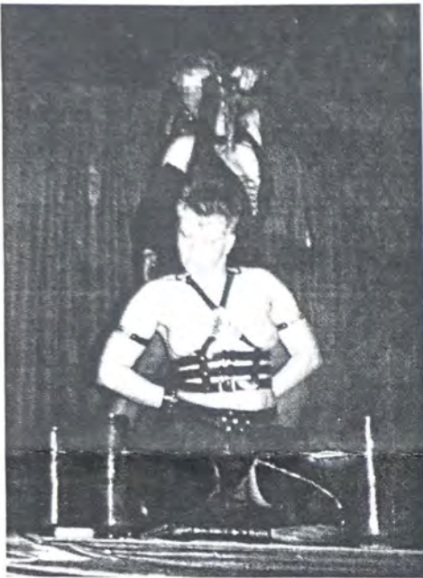
Leslie's hot, Hot, HOT fantasy